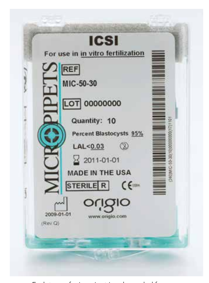
Each type of micropipet is color-coded for easy identification between pipet types.

Humagen ICSI pipets are designed with a sharp spike for easy penetration of the zona pellucida while minimizing damage to the oocyte.